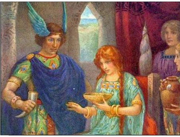
Freyr and Gerd: Lovesick Norse God Seeking Giantess